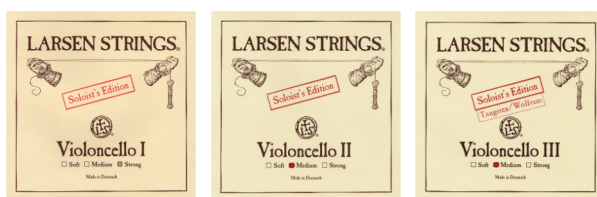
A Soloist Strong D Soloist Medium G Soloist Medium

The strings are based on solid steel cores, different in properties and dimensions from their Original cello counterparts. The A and D wound with precision rolled stainless steel flat wire and the G with tungsten/flat wire.